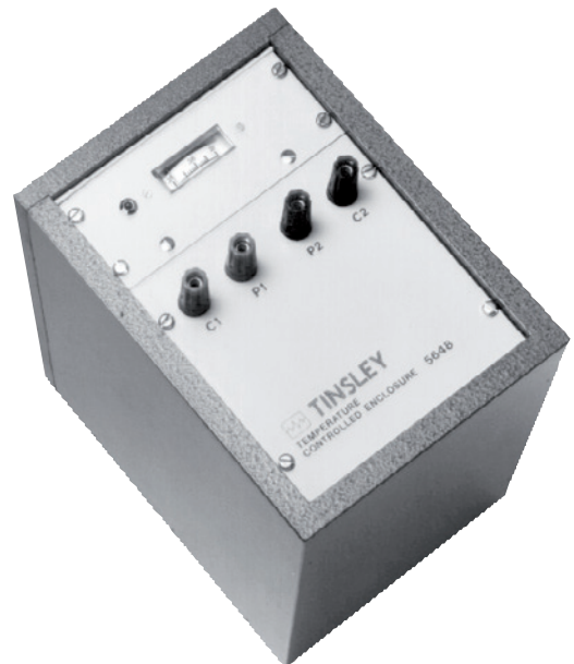
Thermal enclosure for CER6000-RW resistors, at a fixed temperature of 36 °C