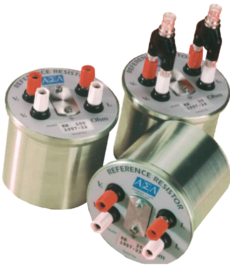
Model CER6000-RR reference resistors with different resistance range