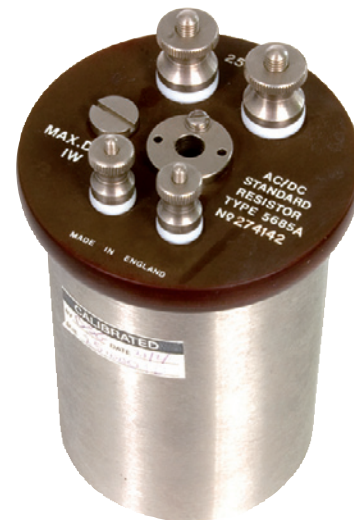
Standard reference resistor, model CER6000, 10 Ω