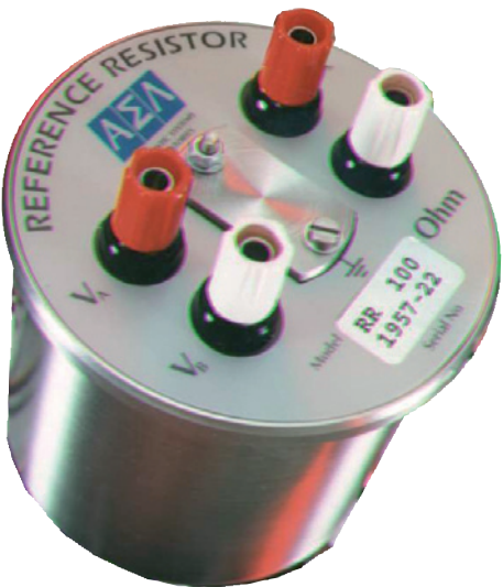
Reference resistor, model CER6000-RR with 100 \Omega