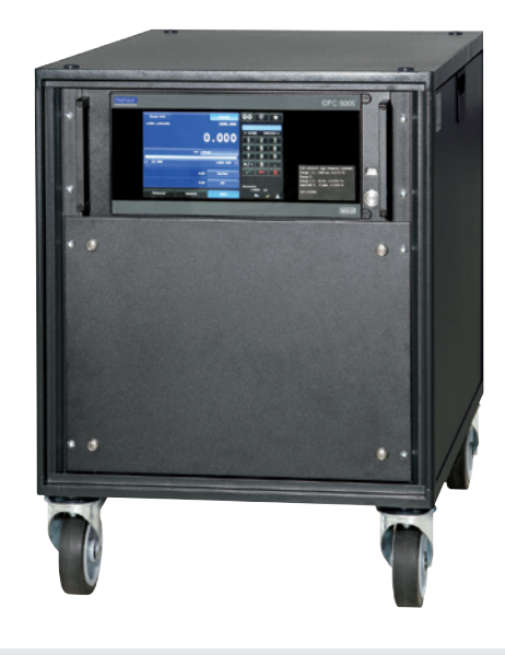
Precision high-pressure controller, model CPC8000-H