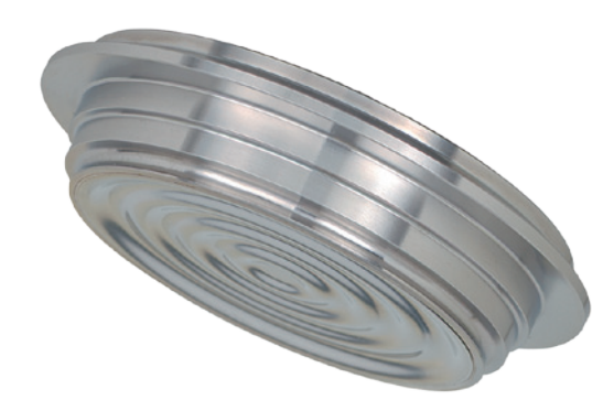
Diaphragm seal with sterile connection, model 990.24