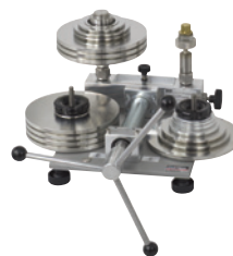
Pressure balance model CPB3000

Specifications according to data sheet CT 31.05