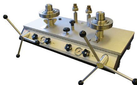
Differential pressure balance model CPB5000DP

Specifications according to data sheet CT 31.52