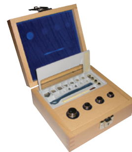
Set of trim-masses

1 x 50 g / 2 x 20 g / 1 x 10 g / 1 x 5 g / 2 x 2 g / 1 x 1 g / 1 x 500 mg / 2 x 200 mg / 1 x 100 mg / 1 x 50 mg / 2 x 20 mg / 1 x 10 mg / 1 x 5 mg / 2 x 2 mg / 1 x 1 mg