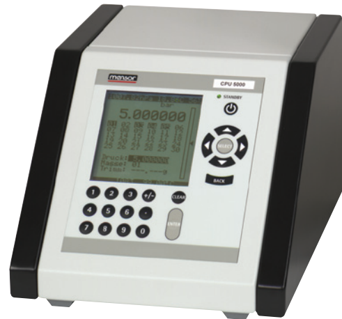
CalibratorUnit model CPU5000

Further specifications to CalibratorUnit CPU5000 see data sheet CT 35.01.