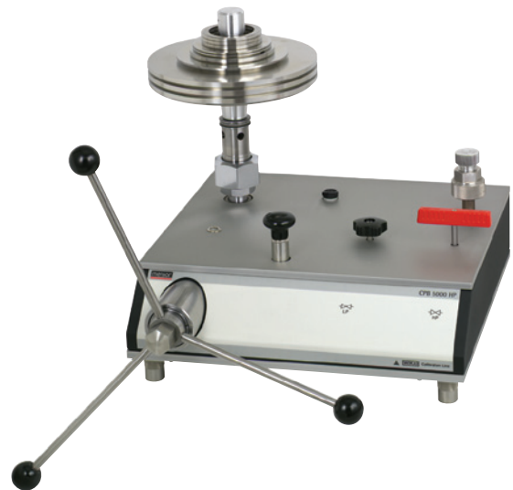
High-pressure pressure balance model CPB5000HP