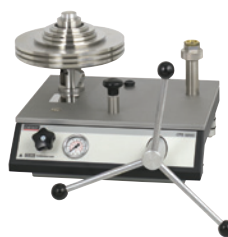
Pressure balance model CPB5000

Specifications according to data sheet 31.01